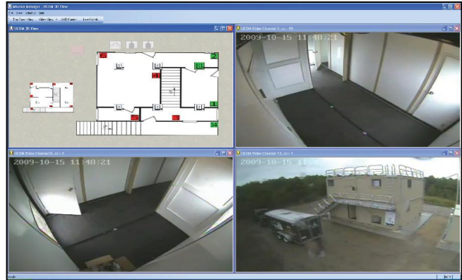
After Action Review (AAR) capability using camera and other automation

Endless building layout options feature open floor plans with large rooms, as well as scalable architecture capable of multi-story buildings. Interior and exterior features can be easily modified for mission rehearsal or to keep training challenging. The RATPAC™ system is flexible both in physical layout and in system control, which enables future growth of the training environment while meeting the needs of the evolving training methodology. The RATPAC can be used as a single structure to provide basic skills training at the individual level or integrated into urban villages consisting of multiple structures to train at the squad level. The structures