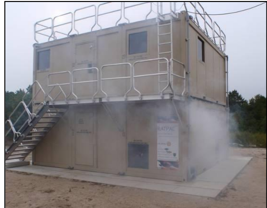
Smoke generator option