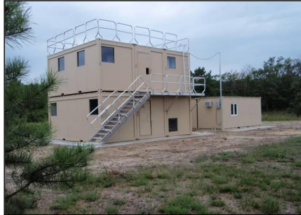
Assembling several RATPAC modules for a training system. Assembled RATPAC system with AAR unit.

can be configured to present urban street scenarios to enable convoy, escort and checkpoint training. Options can also be configured to provide a watch over a rooftop.