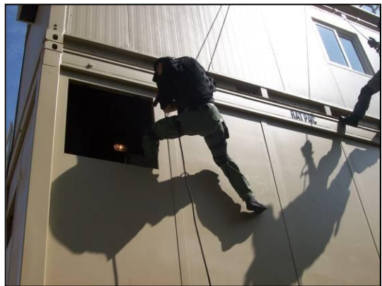
Top floor has a flat rappelling platform that integrates to the top RATPAC module

See training scenarios in the RATPAC through the online video at www.ratpac.com .